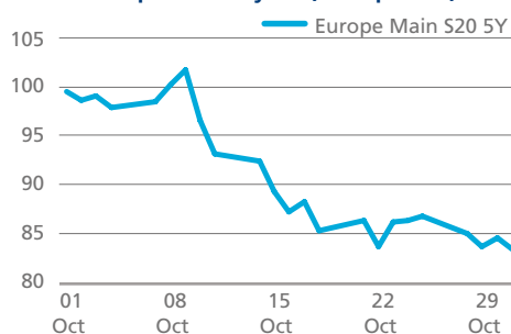
iTraxx Europe Main 5 year (mid spreads)