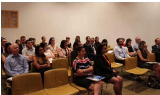
The attendees of the Dematerialisation event

Over the past 18 months, requests for dematerialisation of securities that are not listed or traded on the Exchange have increased considerably. Issuers are increasingly seeking to take advantage of this cost-effective and secure option and benefit from the cross-border and custody services provided within a highly-regulated operation.