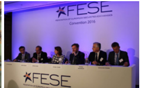
Top table of the Fese Conference

On 16 June the Exchange hosted the FESE Convention 2016 which brought together over 130 delegates from all its member exchanges as well as other entities. A number of speakers and panellists during this one-day conference with the theme "Better Together" addressed the Capital Markets Union, regulation, derivatives reform as well as 3rd country regimes.