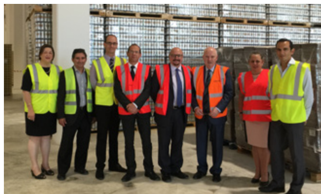
Farsons and Exchange Executives during a visit to the Farsons complex