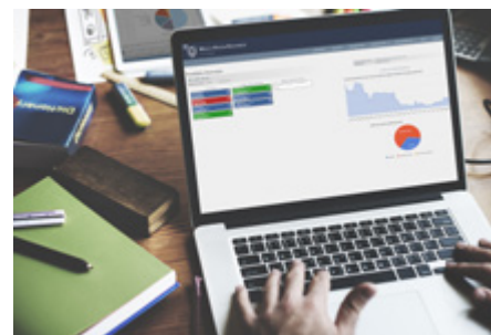
The e-Portfolio interface

Following a number of internal presentations to staff and a soft-launch on 21 June 2016 when the Exchange gave Members a walk-through of the new on-line system, e-Portfolio was publicly launched on 27 June 2016. Initial take-up of e-Portfolio has been very quick and is anticipated to increase as more and more investors are being introduced to this service by their brokers. This is the first time in the Exchange's 25 year history that its 70,000 account holders have been given online access to their accounts. With this new service, investors can view valuation changes in their CSD investment portfolios, access their holding positions and transactions, and the latest Annual Reports for all Exchange tradeable instruments. A number of additional services and notifications are also being planned and will be rolled out by the first quarter of 2017.