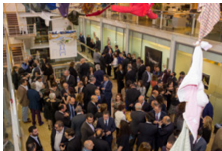
The guests at the opening event

As part of its Corporate Social Responsibility initiatives, for the first time the Exchange hosted an art exhibition, between April and June, showcasing the work of up-and-coming Maltese artists. The Art Exhibition, with the theme "On Spatial Concerns" was officially opened by HE the President of the Republic, Ms Marie Louise Coleiro Preca on 23 April 2016 during an event organised to mark the occasion. The exhibition which included paintings, prints and various installations including videos, attracted around 750 visitors who not only had the opportunity to view the works but also had the opportunity to visit and walk around the Exchange's iconic building.