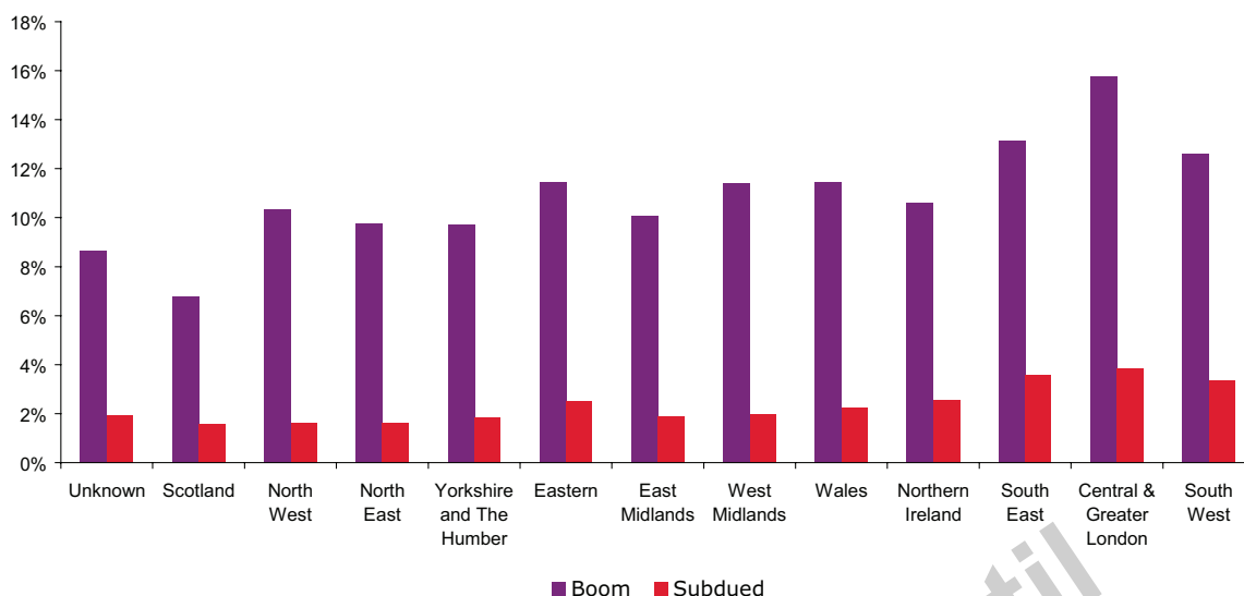
Figure 2 – Responsible lending proposals – proportion of borrowers affected in different regions

impaired borrowers, Wales is most affected by the responsible lending package over the boom period and Northern Ireland over the subdued period. 2